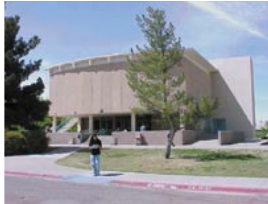
O'Donnell Hall is the main facility of the College of Education